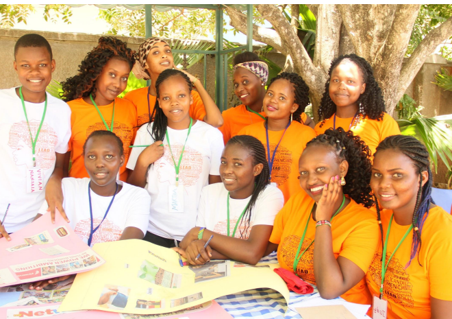
Akili Dada Kenya