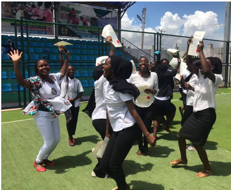
Celebrating graduation from employability training

The Ujima Foundation, located in Kenya, has been a Member of One World since 2017