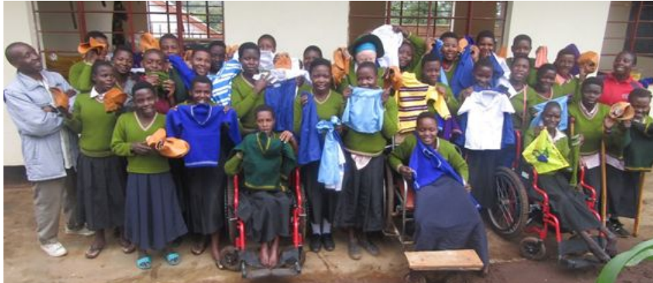
Sharing handmade crafts from CBIDO Tanzania