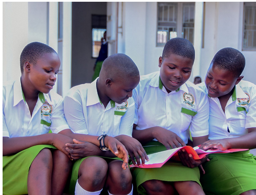
Beso Foundation, Uganda

Beso's school is free to the local community, making it easier for parents to pay for food and other essentials. The school has a student to teacher ratio of 25:1. While the school is still new, Beso is already seeing indications of reduced dropout rates.