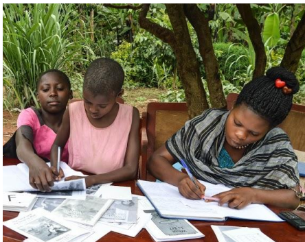
Studying with Peerlink Uganda