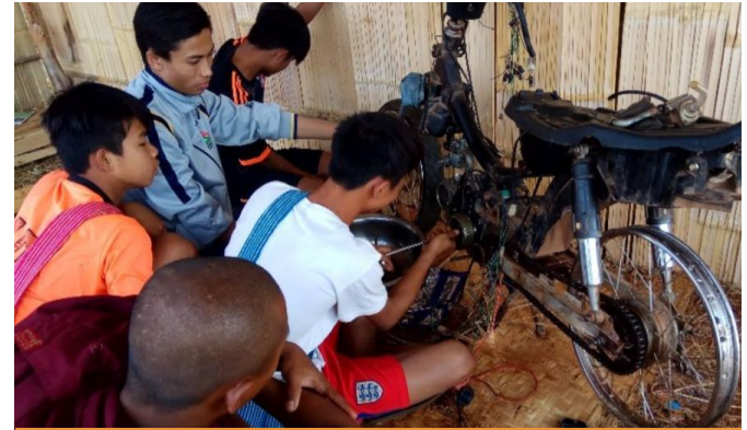
Motorbike repair training at PNDO Thailand/Myanmar