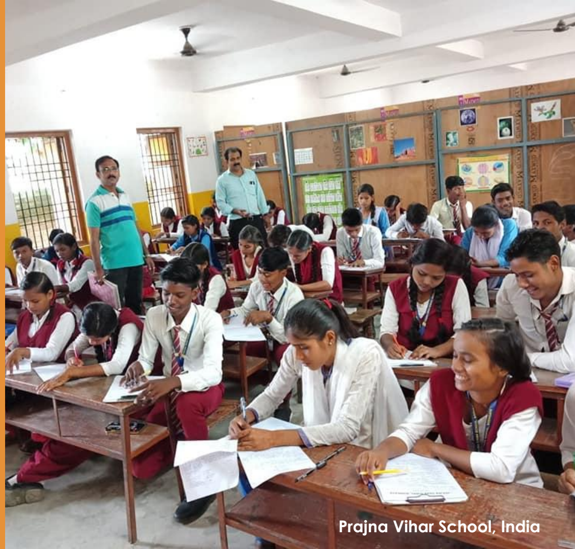
Prajna Vihar School, India