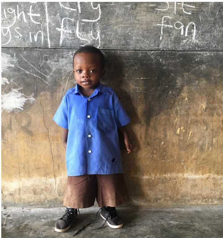
Offin Children's Center, Ghana