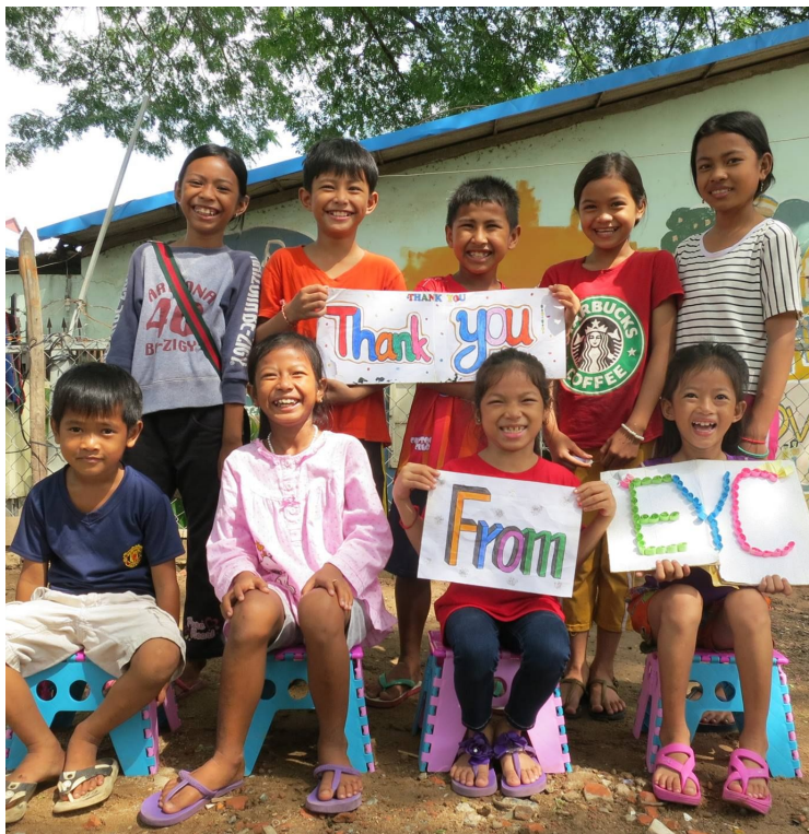
Empowering Youth in Cambodia

Our grassroots leaders, volunteer Champions, Board, staff, and supporting network generously share their expertise and assistance to help each other overcome challenges and implement best practices for creating sustainable organizations.