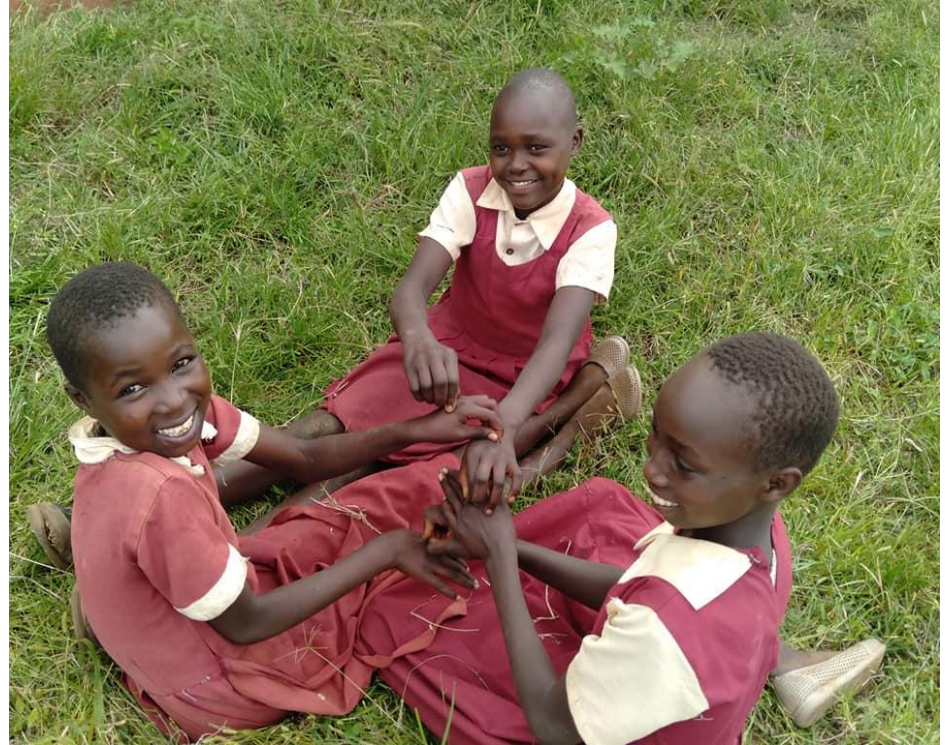
Dandelion Africa, Kenya

One World has been bridging this gap since 2000.